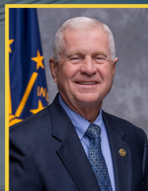
State Senator Ed Charbonneau Senate District 5