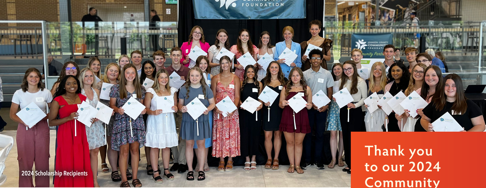
2024 Scholarship Recipients