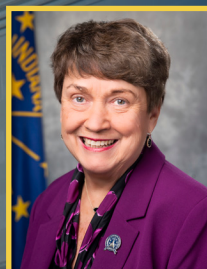
State Senator Jean Leising Senate District 42