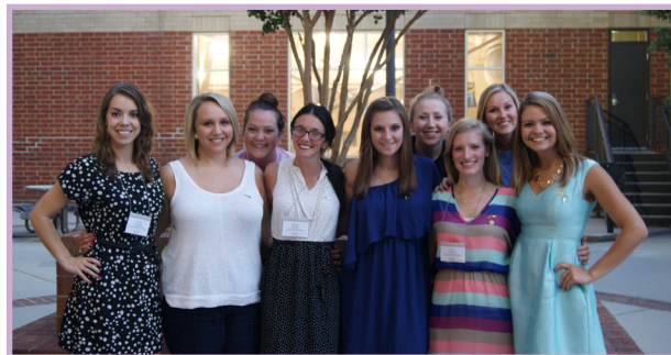
2014 The Founders' Academy

As mentioned in the Campaign update, a key focus of the Campaign for the 125 th is to establish a fund that will allow the Fraternity to support The Founders' Academy. Your gifts will help ensure that Alpha Xi Delta can continue to provide high quality leadership training and personal development for generations of Sisters to come. Make a gift to help support The Founders' Academy now.