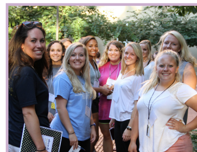
2016 The Founders' Academy

This year's theme for The Founders' Academy is "BELIEVE in YOUrself." As in year's past, TFA is a CliftonStrengths (formerly known as StrengthsQuest™) based program that spends time helping participants truly understand their own strengths while seeing how they can also work better with others while moving their chapter forward. A key component of Gallup's Clifton Strengths is honing those natural talents (strengths) and capitalizing on who you already versus trying to be something you are not or perhaps is not as much as strength for you. It takes a healthy dose of believing in yourself to accomplish any goal and with utilizing your strengths the bolded areas of our theme "BE YOU" highlight the importance of embracing who you already are.