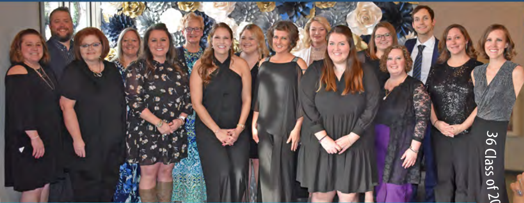
36 Class of 2022 Signature Program Graduates!