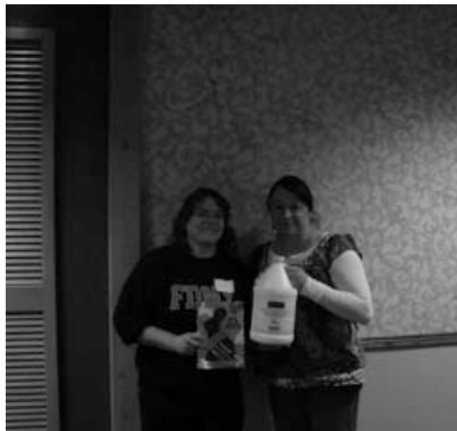
Raffle prize winners from the February conference.