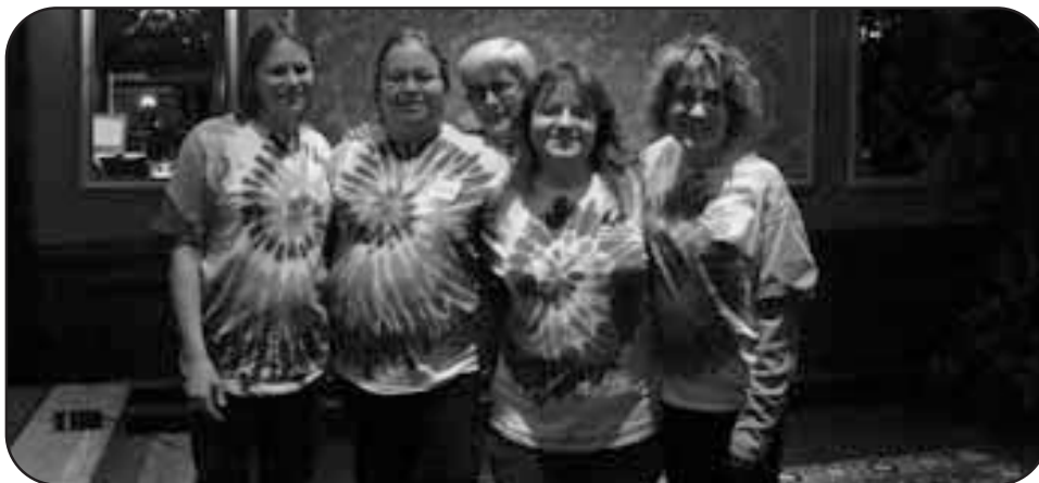
Your GROOVY Board of Directors

Chapter Meeting Sunday 9/13/09 11:30 (lunch) Meeting at 12:30 Be there to help decide the future of your profession and association. See pages 10 & 11 for more information.