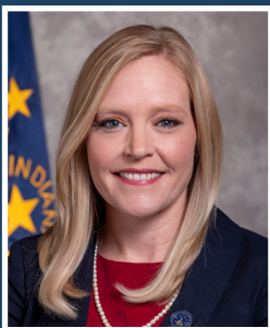
State Senator Erin Houchin Senate District 47