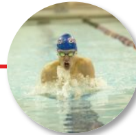
ECA/ Co-Curricular Clubs, band, choir/ athletic teams