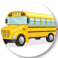
Transportation Model How to safely transport students