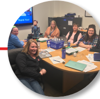
School Day Operations Daily student/staff procedures