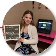
Remote Learning Model Combination remote/ e-Learning instruction