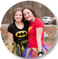
Traditional Learning Model In-person student instruction