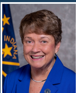
State Senator Jean Leising Senate District 42