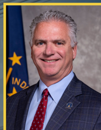
State Senator Eric Bassler Senate District 39