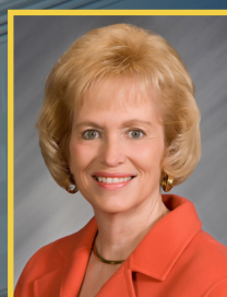
State Senator Vaneta Becker Senate District 50