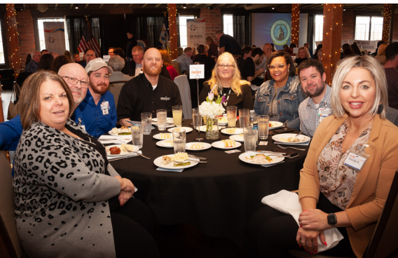
↑ The team from Meijer at the Chamber's Annual Meeting in February.

It will be interesting to see the impact of AI as it expands into the workplace and our homes – make no mistake it is already there. I rely on my friend, Alexa, to wake me up, tell me a joke, look up a recipe and play my favorite songs on a daily basis. We are only experiencing the tip of this technology; brace yourself, friends; it's soon to be part of our world!