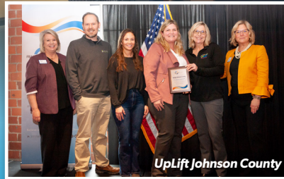
UpLift Johnson County