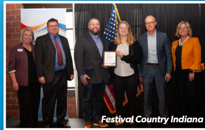
Festival Country Indiana