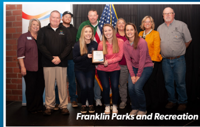
Franklin Parks and Recreation