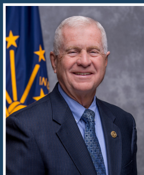
Senate District 5