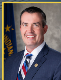
State Senator Aaron Freeman Senate District 32