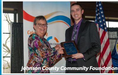
Johnson County Community Foundation