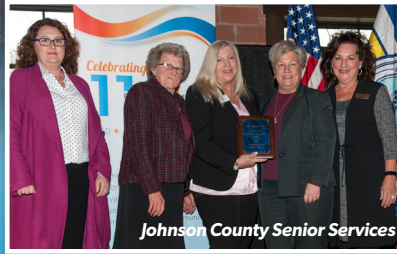
Johnson County Senior Services