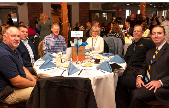
Representatives from DuKate Fine Remodeling at the Chamber's Annual Awards Banquet. Special thanks to DuKate for sponsoring the event.