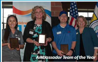
Ambassador Team of the Year