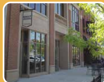
► The Daily Journal office is on East Court Street in downtown Franklin.