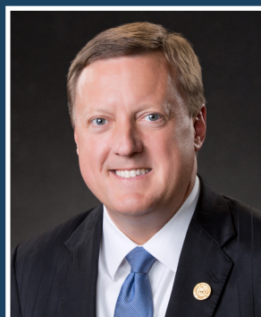
Senate District 44