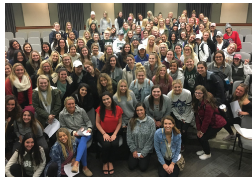
The Pi Chapter at Ohio University

The Leadership Coach Program is unique to Alpha Xi Delta. It is fully funded by the Alpha Xi Delta Foundation through the generosity of her donors. Our Leadership Coaches (LCs) provide one-on-one coaching to help undergraduate Sisters develop leadership skills and enhance their personal growth including communication skills, personal development, career preparation and StrengthsQuest™. They also provide chapter programs through the Inspire program and to facilitate growth of chapter members and encourage reflection and development.