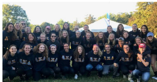
The Iota Xi Chapter at Worcester Polytechnic Institute