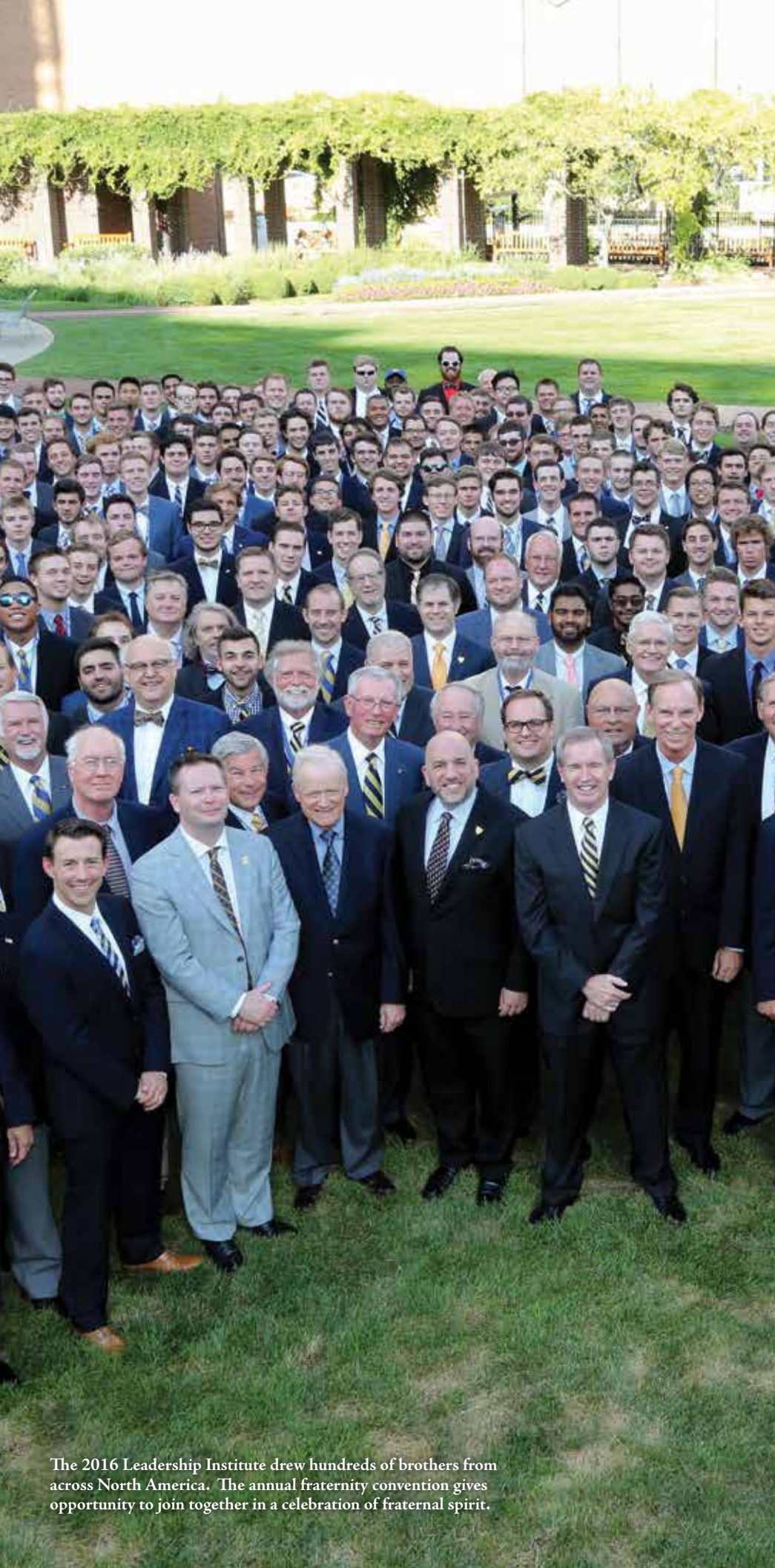
The 2016 Leadership Institute drew hundreds of brothers from across North America. The annual fraternity convention gives opportunity to join together in a celebration of fraternal spirit.