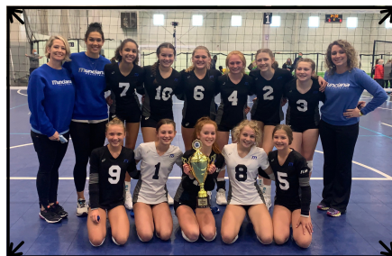
Head Coach 120 Peppers

This years group is talented beyond belief. I'm amazed at each practice at the skills they have mastered and how much their volleyball IQ has improved. They have set a new standard for future Peppers. I have 12 players who can step on the court at anytime and serve under pressure and make big time plays. And yet as talented as they are, their potential and willingness to learn means we have yet to play our best match. I look forward to every tournament for the opportunity to see how they have refined a skill or showcase something new we have been working on. The sky is the limit for these athletes and I'm very blessed to be their coach.