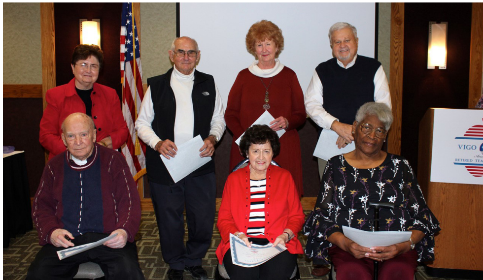
current living and past presidents.

Decorated and logo mementos were available for members to take home to remember the event.