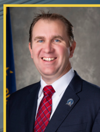
State Senator Brian Buchanan Senate District 7