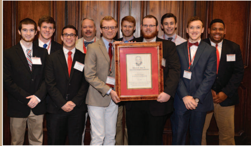
Iota Tau brothers receive the Alter Award at the 160th Anniversary Convention.

As they say, "you get out what you put in."