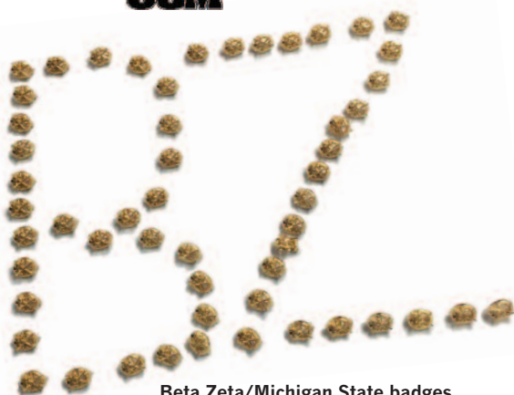
Beta Zeta/Michigan State badges