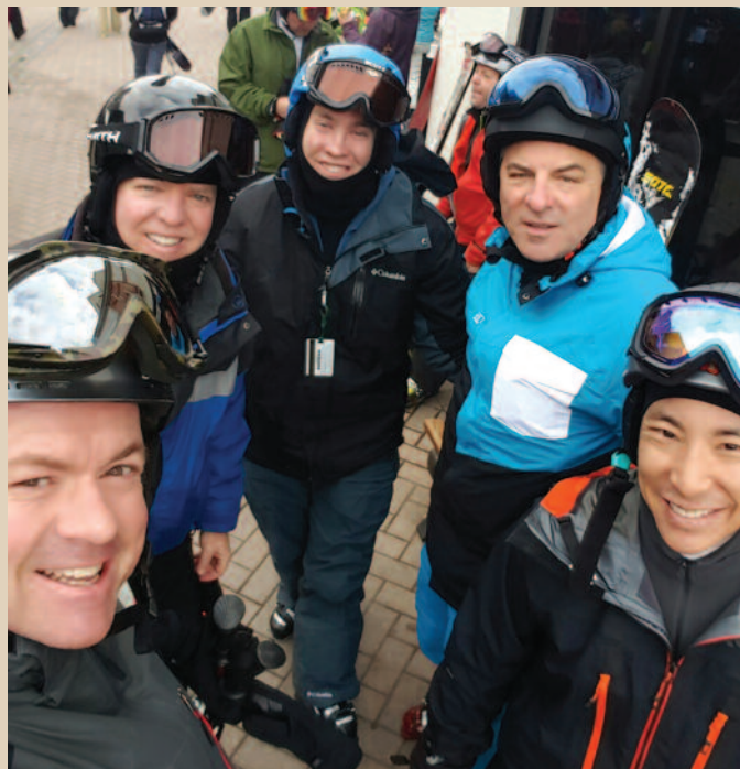
Ski Bums getting ready to hit the slopes.

The 37th Annual Ski Trip International DeVol Ski Trip will be held at Mammoth Lakes, CA, from February 23–27, 2018. Mark your calendar!