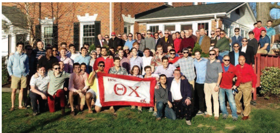
ALPHA PSI/Maryland alumni celebrate Founders Day 2017 at the chapter house with collegiate members at the University of Maryland.