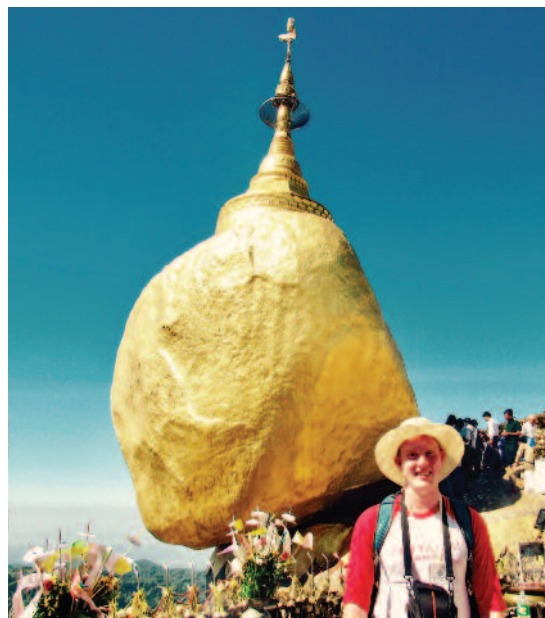
At the Kyaiktiyo Pagoda in eastern Myanmar.

Finally, this trip convinced me that I do not want to stop seeing new places and experiencing different types of people. As a consequence, I have accepted an invitation to serve as a Peace Corps Volunteer in Mozambique, where I will be spending the next two years as a secondary (high school) chemistry teacher beginning in late August. Here's to another adventure.