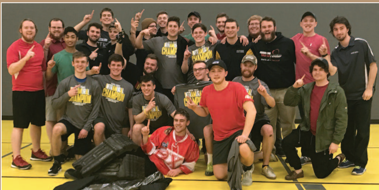
The Iota Tau Chapter after its first intramural championship win in floor hockey.