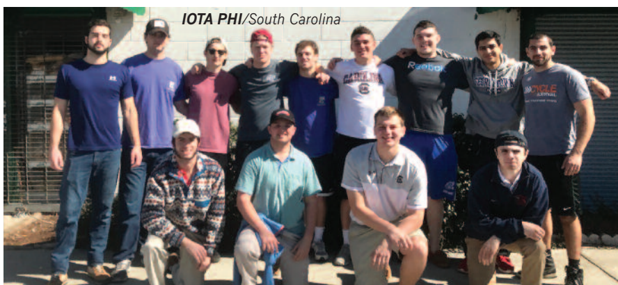
IOTA PHI/South Carolina

surpassed $6,570 for Dobby, but obliterated it with $27,000 raised in four short days. This included donations from every sorority on campus, other IFC fraternities, the Kennesaw State community, and even an anonymous $10,000 donation. This week not only exemplified what it means to be a Theta Chi, but it raised awareness for a cause that is truly bigger than all of us.