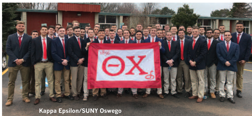
Kappa Epsilon/SUNY Oswego