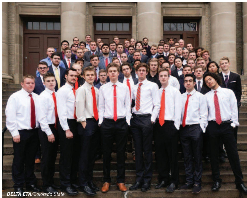
DELTA ETA/Colorado State