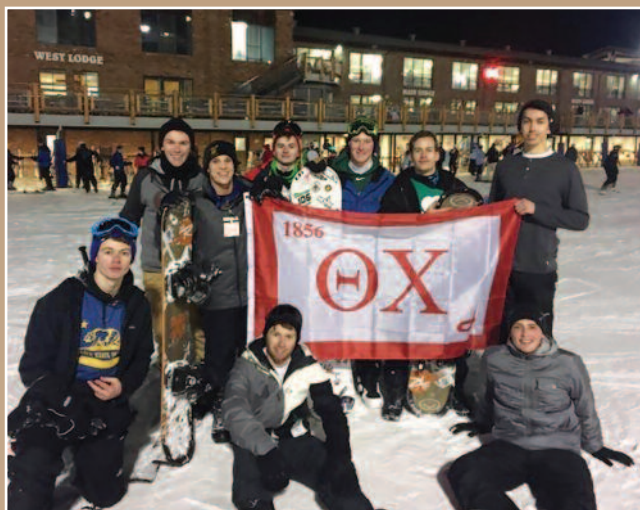
ABOVE: Iota Tau brothers enjoy the annual ski trip to Perfect North Slopes in Lawrenceburg, IN.