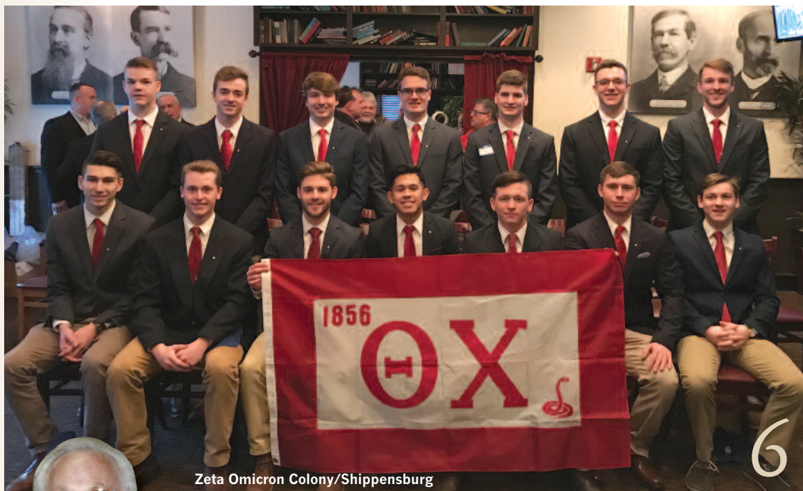
Zeta Omicron Colony/Shippensburg