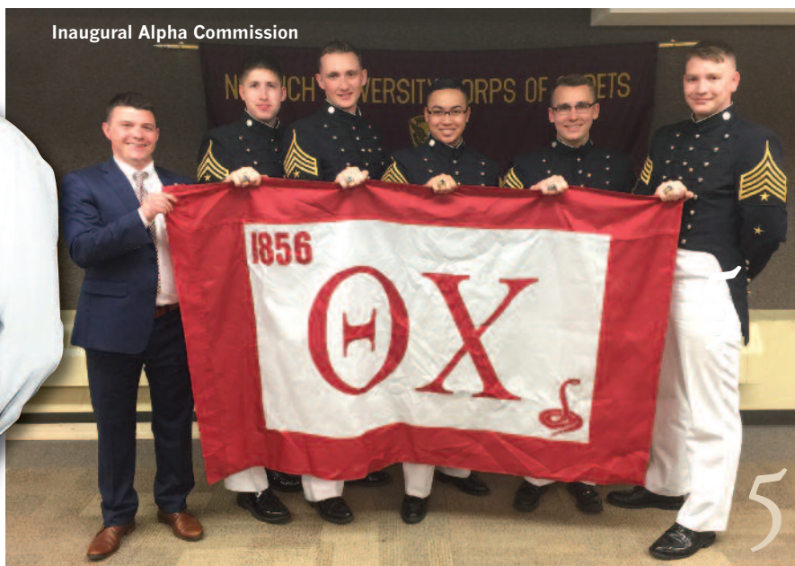
Inaugural Alpha Commission

New England Patriots Defensive Coordinator Matt Patricia (Delta/RPI 1996) celebrates after the overtime victory in Super Bowl LI. Learn more about his Theta Chi experience on page 8.