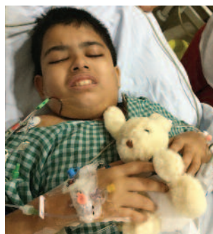
A young patient in Kolkata, India clings to the toy provided by Zeta Omicron Colony brothers.