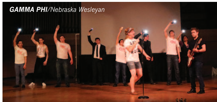
GAMMA PHI/Nebraska Wesleyan

lip sync competition, beating out the traditional sorority powerhouses.