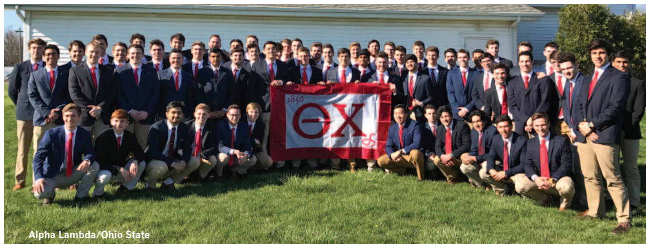
Alpha Lambda/Ohio State