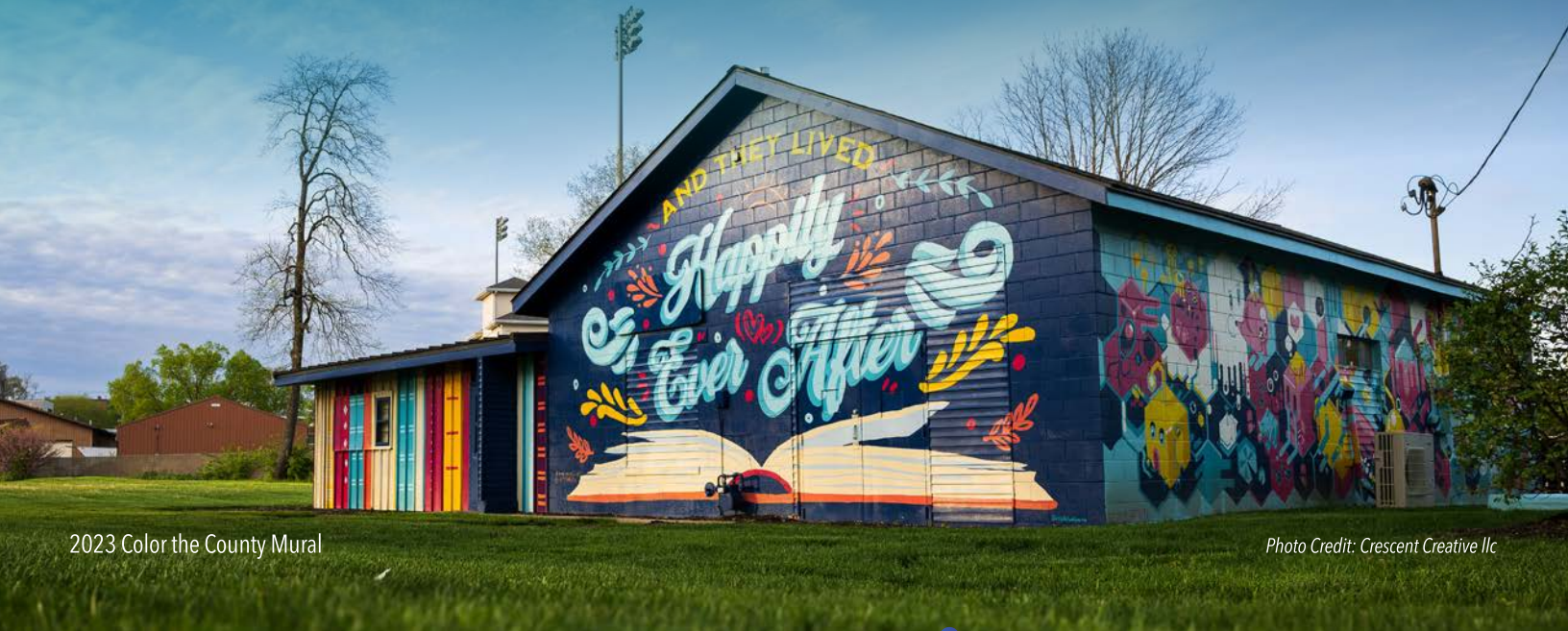
2023 Color the County Mural