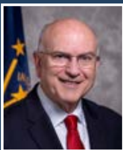
State Senator Dennis Kruse Senate District 14