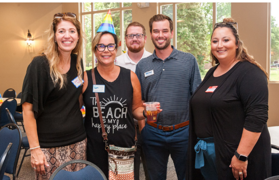
↑ The Chamber welcomed members to a complimentary cookout in July.

Small businesses play a crucial role in the economic and social development of a community. In Franklin, small business owners and employees are friends and neighbors who are the backbone of our city. I am delighted to assist in strengthening these businesses that are so important to the vibrancy of our community and grateful for the funding of this pilot program from the Franklin Economic Development Commission. I look forward to sharing the recipients of this grant funding very soon!