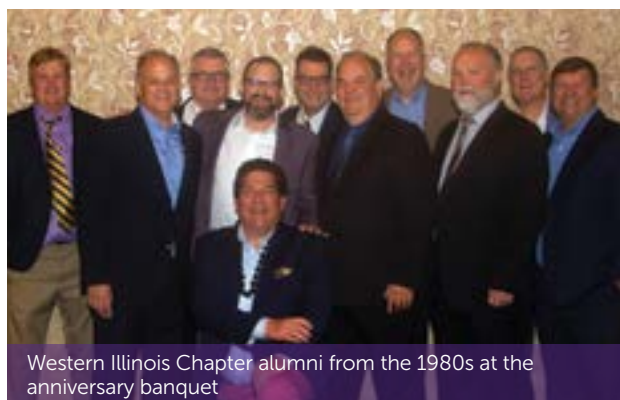
Western Illinois Chapter alumni from the 1980s at the anniversary banquet