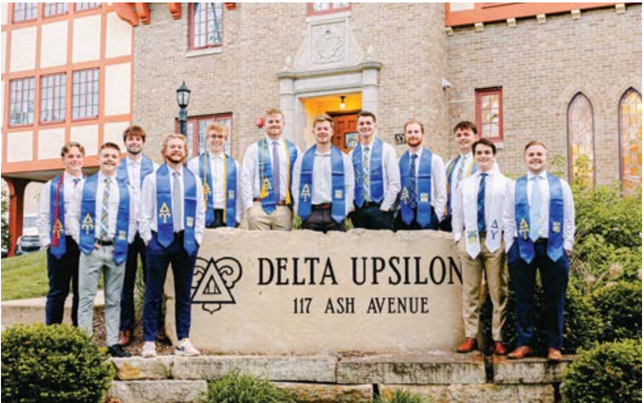
Iowa State Chapter

The Wisconsin Chapter hosted a number of events this year, including a successful Mom's Weekend in which it even hosted a live band for their mothers. Brothers hosted fundraising events for Marine veterans, as well as for Girls on the Run. The chapter's Associate Member Education Program also provided several opportunities for the 30 new members (19 in the fall and 11 in the spring) to spend time with the chapter's seniors. This summer, brothers are taking part in internships at places such as the Wisconsin Housing and Economic Development Authority, Wintrust Financial Corporation, United Airlines and more.