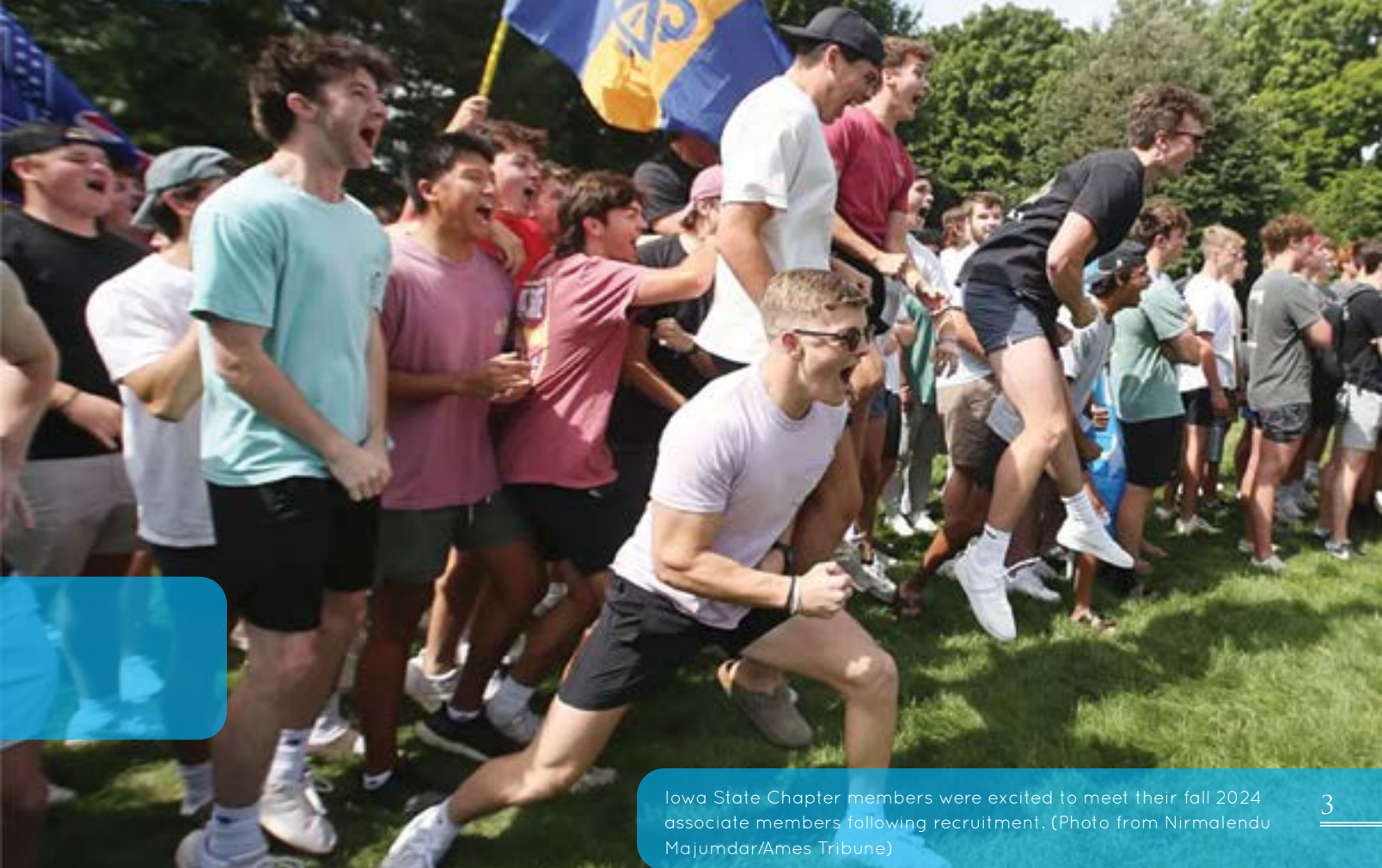
Iowa State Chapter members were excited to meet their fall 2024 associate members following recruitment.