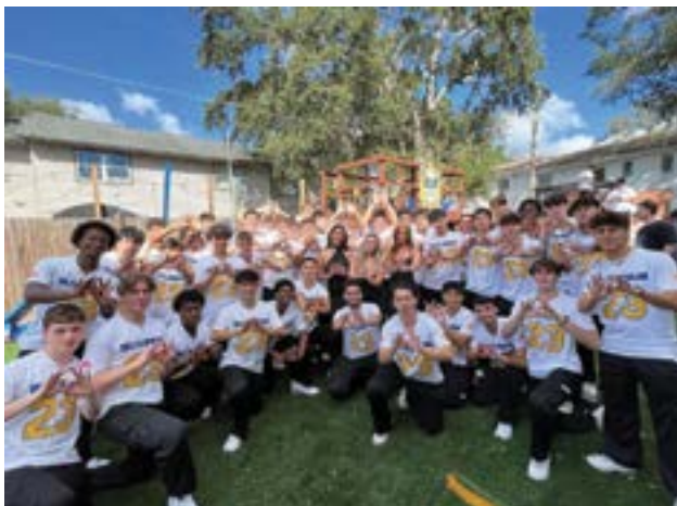
Central Florida Chapter