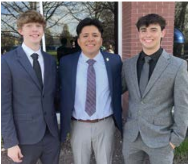
Boise State Chapter