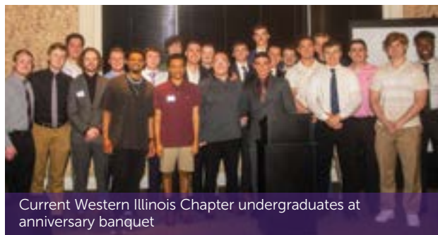
Current Western Illinois Chapter undergraduates at anniversary banquet

The chapter began as a local fraternity named Lambda Tau Beta before becoming part of Delta Upsilon on April 27, 1974. Since that time, the chapter has held an anniversary celebration every five years, along with other events in Macomb and the Chicagoland area. This close-knit alumni community has helped the chapter thrive, particularly in recent years, as it was named the Fraternity's Most Improved Chapter in 2019 and a Sweepstakes Finalist in 2021, 2022, 2023 and 2024. In conjunction with the 50th anniversary celebration, the alumni announced a fundraising campaign for updates to the chapter house, which as of May 23, 2024, has raised more than $42,000.