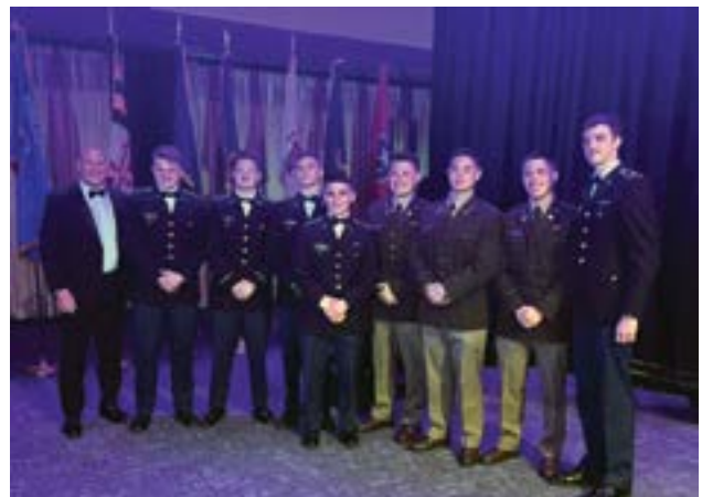
Western Illinois Chapter