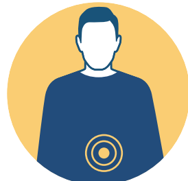
NAUSEA OR VOMITING