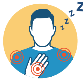
MUSCLE PAIN AND FATIGUE