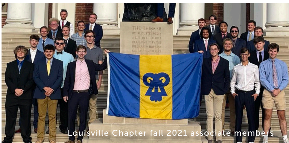
Louisville Chapter fall 2021 associate members