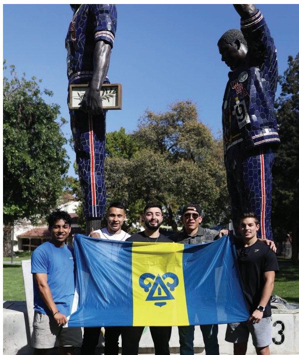
San Jose Chapter

Because of university guidelines, the Western Reserve Chapter was remote all academic year, but that didn't stop the chapter from having fun and making an impact. Chapter events included a virtual poker night philanthropy event, using Discord to play games and have get-togethers, and participating in a virtual Greek Week. Those near campus were also able to participate in an outdoor service event and beach volleyball games.