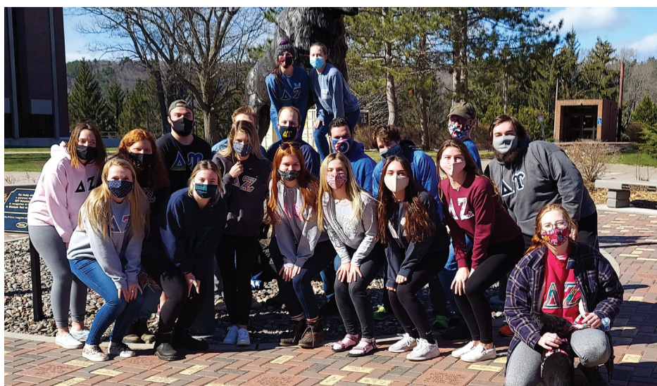
Michigan Tech Chapter

The spring was an exciting term for the North Carolina Chapter. The brothers scored the top GPA of Greek groups on campus with a 3.813 GPA. To do this, the men instituted new studying measures to make the chapter house more conducive to studying while also adhering to social distancing guidelines. In May, the chapter broke ground on a new kitchen and other house renovations. With the help of alumni, the chapter will now have an upgraded kitchen and in-house chef. Improvements to the basement and electrical work will also take place.