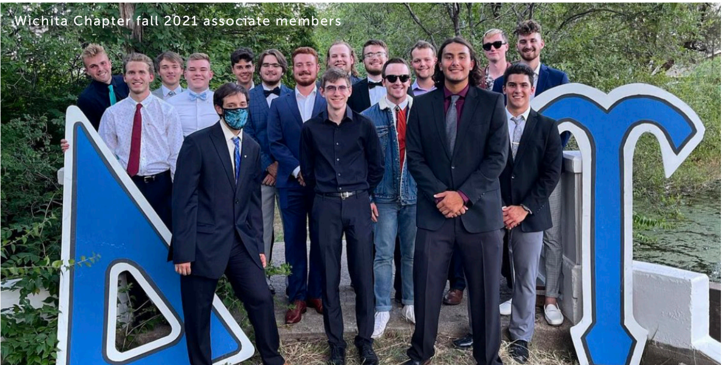
Wichita Chapter fall 2021 associate members