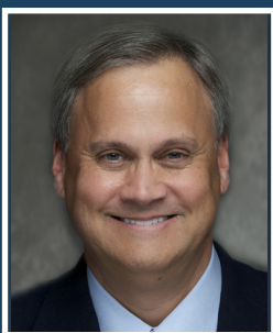
State Senator Jim Merritt Senate District 31