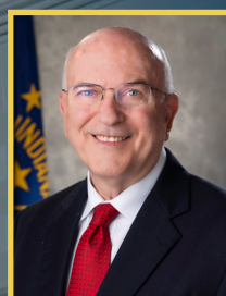
State Senator Dennis Kruse Senate District 14