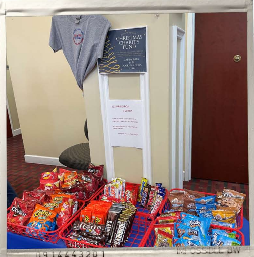
T-SHIRTS AND SNACK PURCHASES HELPED TO PROVIDE CHARITY TO THOSE IN OUR COMMUNITY MOST IN NEED.

When you visit the credit union, you have the opportunity to purchase candy bars, snacks, or commemorative T-shirts. Proceeds from these generous purchases are deposited into a charity fund. Each year, your purchases and donations allow Independent Federal Credit Union to adopt families in need from local Anderson Elementary Schools and provide them with a wonderful Christmas. Each child receives a few toys from their wish lists and needed clothing items as well as gloves, hats, scarves, and a winter coat to keep them warm throughout the winter. We also provide something for the parents along with household and food items. Like always, our members got involved. Members had the opportunity to pull tags from our Giving Christmas Trees and shop. Members chose a tag and brought the unwrapped item to the credit union. This was particularly fun for our younger members who could help other kids near their age to share in the Christmas spirit. We love that our members can get the whole family involved to help others in need within our community. Because of the generosity of our great members this Christmas, we adopted a family with six children. These children range in age from 8 to 14 and attend local Anderson schools. The next time you are in the Credit Union, we encourage you to buy a snack or two to take with you to enjoy and with your donation, we will do our part to make sure as many as possible in Anderson don't have to worry about where Christmas is coming from each year.