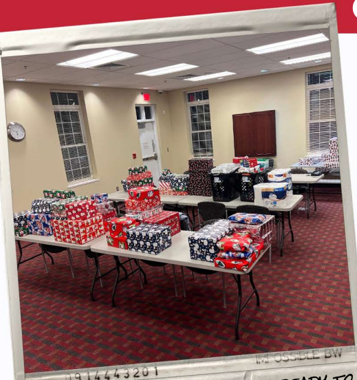
PRESENTS ARE WRAPPED AND READY TO SPREAD HOLIDAY CHEER TO FAMILIES IN NEED.

When you visit the credit union, you have the opportunity to purchase candy bars, snacks, or commemorative T-shirts. Proceeds from these generous purchases are deposited into a charity fund. Each year, your purchases and donations allow Independent Federal Credit Union to adopt families in need from local Anderson Elementary Schools and provide them with a wonderful Christmas. Each child receives a few toys from their wish lists and needed clothing items as well as gloves, hats, scarves, and a winter coat to keep them warm throughout the winter. We also provide something for the parents along with household and food items. Like always, our members got involved. Members had the opportunity to pull tags from our Giving Christmas Trees and shop. Members chose a tag and brought the unwrapped item to the credit union. This was particularly fun for our younger members who could help other kids near their age to share in the Christmas spirit. We love that our members can get the whole family involved to help others in need within our community. Because of the generosity of our great members this Christmas, we adopted a family with six children. These children range in age from 8 to 14 and attend local Anderson schools. The next time you are in the Credit Union, we encourage you to buy a snack or two to take with you to enjoy and with your donation, we will do our part to make sure as many as possible in Anderson don't have to worry about where Christmas is coming from each year.