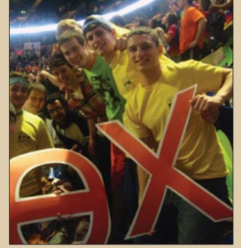
Chapter news PAGE 28