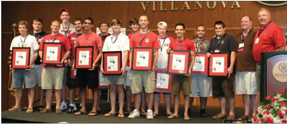
Representatives from each of the 2009 Phil S. Randall Success in Recruitment Award-winning chapters.