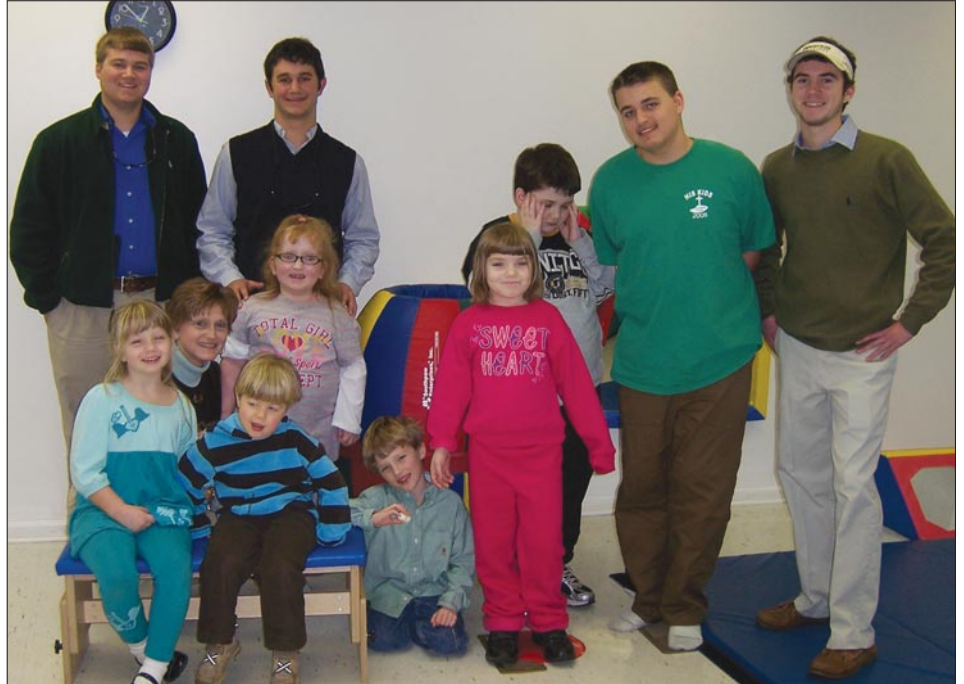
Eta Alpha brothers with students at the SOAR Academy.