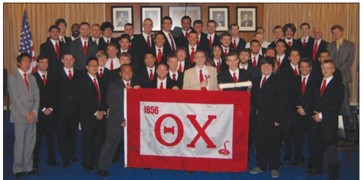
The newly installed Iota Nu chapter at the University of South Florida.