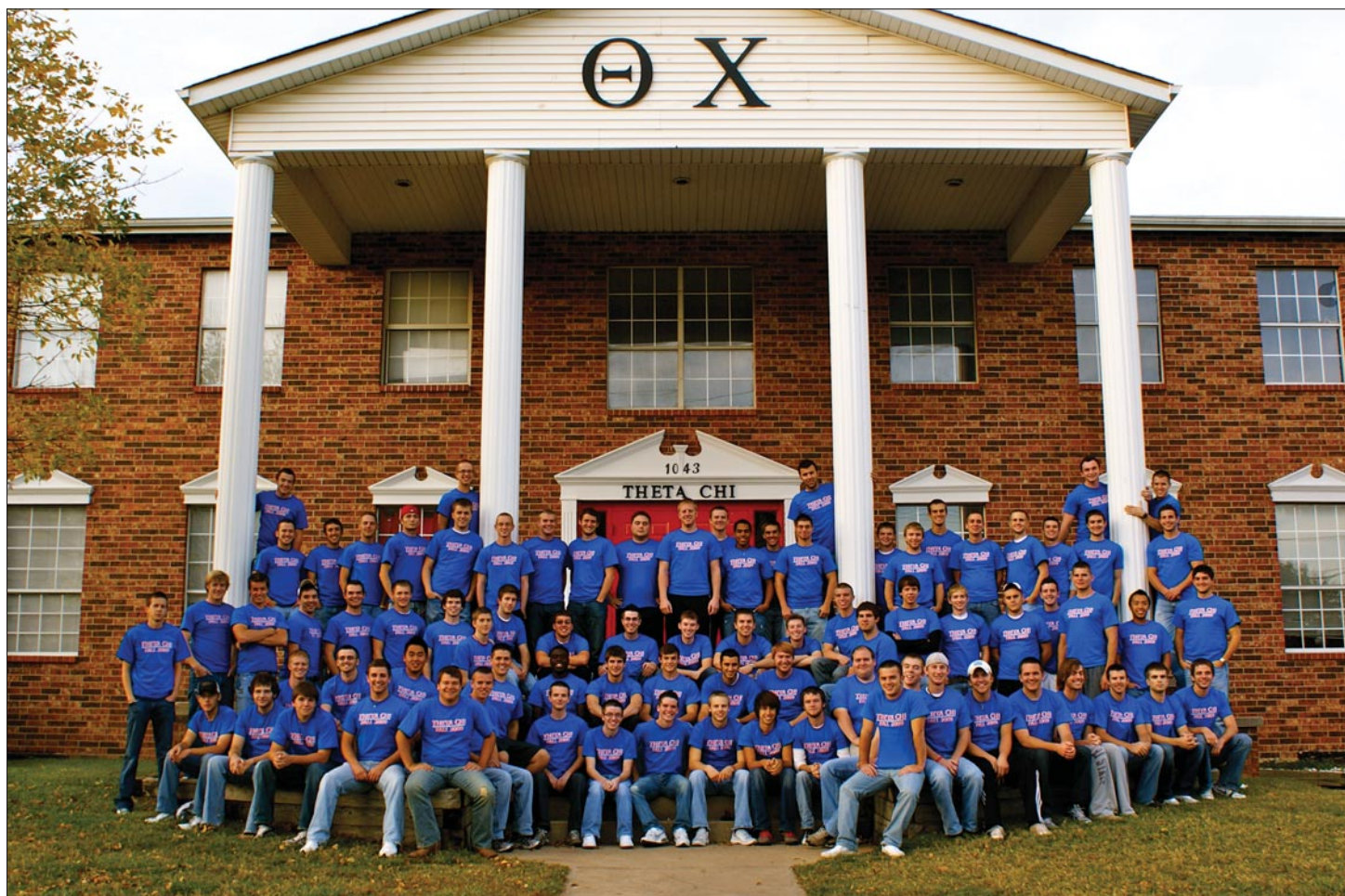
Iota Beta chapter outside the chapter house in 2009.