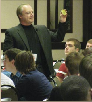
Reflections on the Deranian PAGE 13