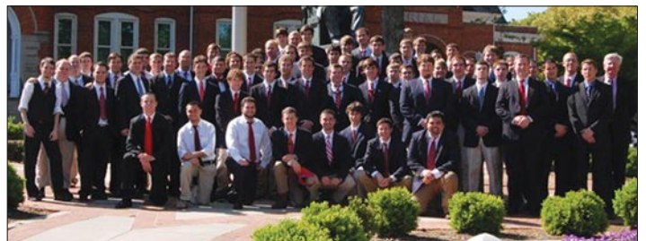
Eta Alpha chapter at Clemson University