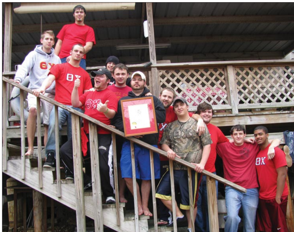
Brothers outside the Theta Rho house in Lake Charles, Louisiana.

Iota Lambda brothers are also active in the Honor Board, Mortar Board, Phi Kappa Phi and Gamma Sigma Alpha honor societies.