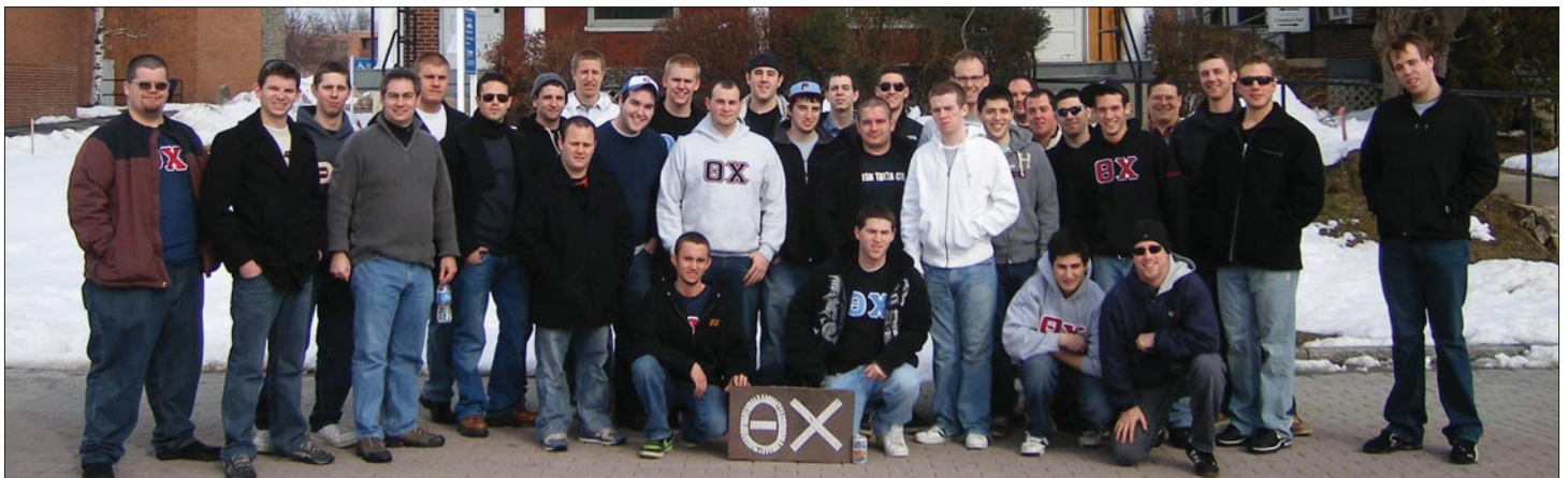
Alumnus and undergraduate brothers of Epsilon Gamma chapter with the hearthstone from Victory Hall, which was recently razed.