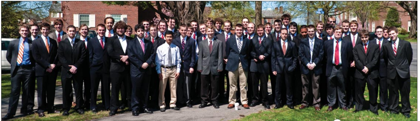
Gamma Eta chapter at Bucknell University