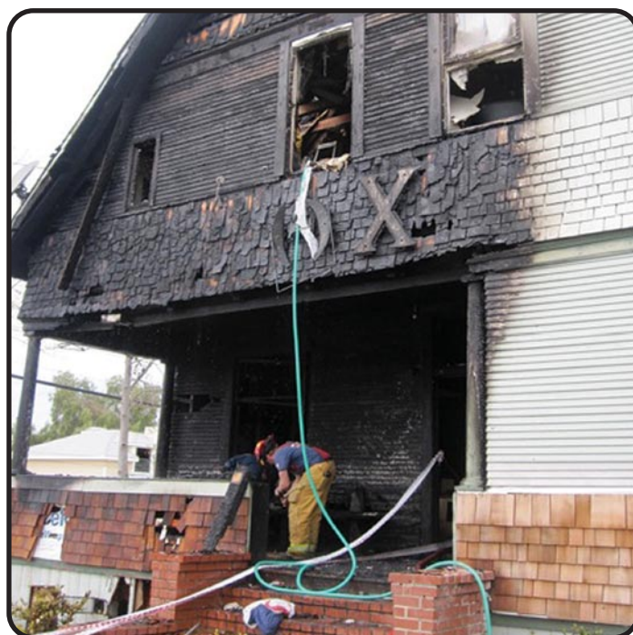
The Zeta Phi chapter house following a massive fire that destroyed 40 percent of the structure. The fire started after painting supplies on the porch spontaneously combusted and spread to a can of paint thinner.

Brothers should also review the housing section of the Theta Chi website ( www.thetachi.org/housing ). There are several life safety resources and checklists that can be used for the chapter house or modified for your home or business.