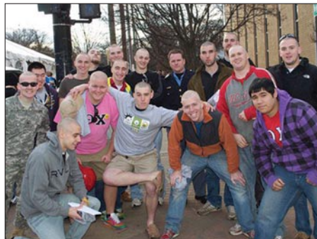
Delta Rho brothers after shaving their heads for St. Baldrick's Day.

orientation leaders, and nine will be Eagle Camp counselors.