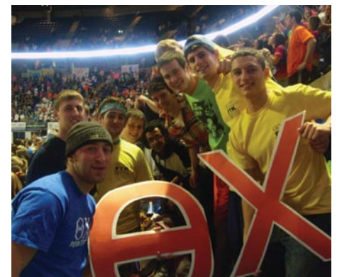
The Omega chapter at Penn State participated in another successful Dance Marathon this year, raising more than $29,000 to help fight childhood cancer.

In fall, Alpha Gamma chapter raised $1,000 for the charity Save a Child's Heart through its annual PULSE! event. This year's PULSE! was