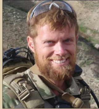
Silver Star hero PAGE 19