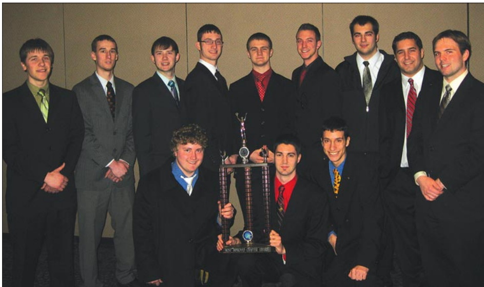
Brothers of Beta Lambda chapter following the 2009 Greek Leadership Awards. Beta Lambda was recognized by Akron's IFC as this year's Most Improved Chapter.