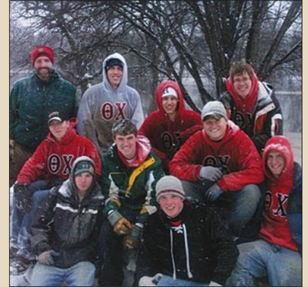
Brothers from Phi chapter take a break while fighting back flood waters in Fargo.

Decisions to publish submitted content are at the sole discretion of the Editor.