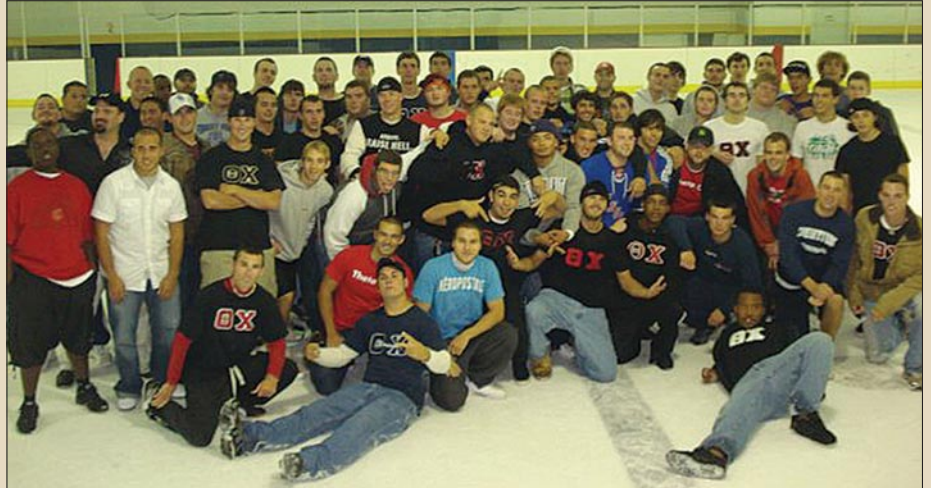
Zeta Pi brothers take a break during a game of broom ball at the Iceland Ice Rink Arena in Virginia Beach.