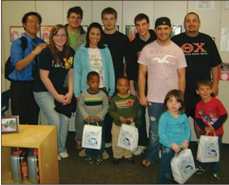
Zeta Tau brothers with children from one Early Childhood Development Center following their annual Easter egg hunt.