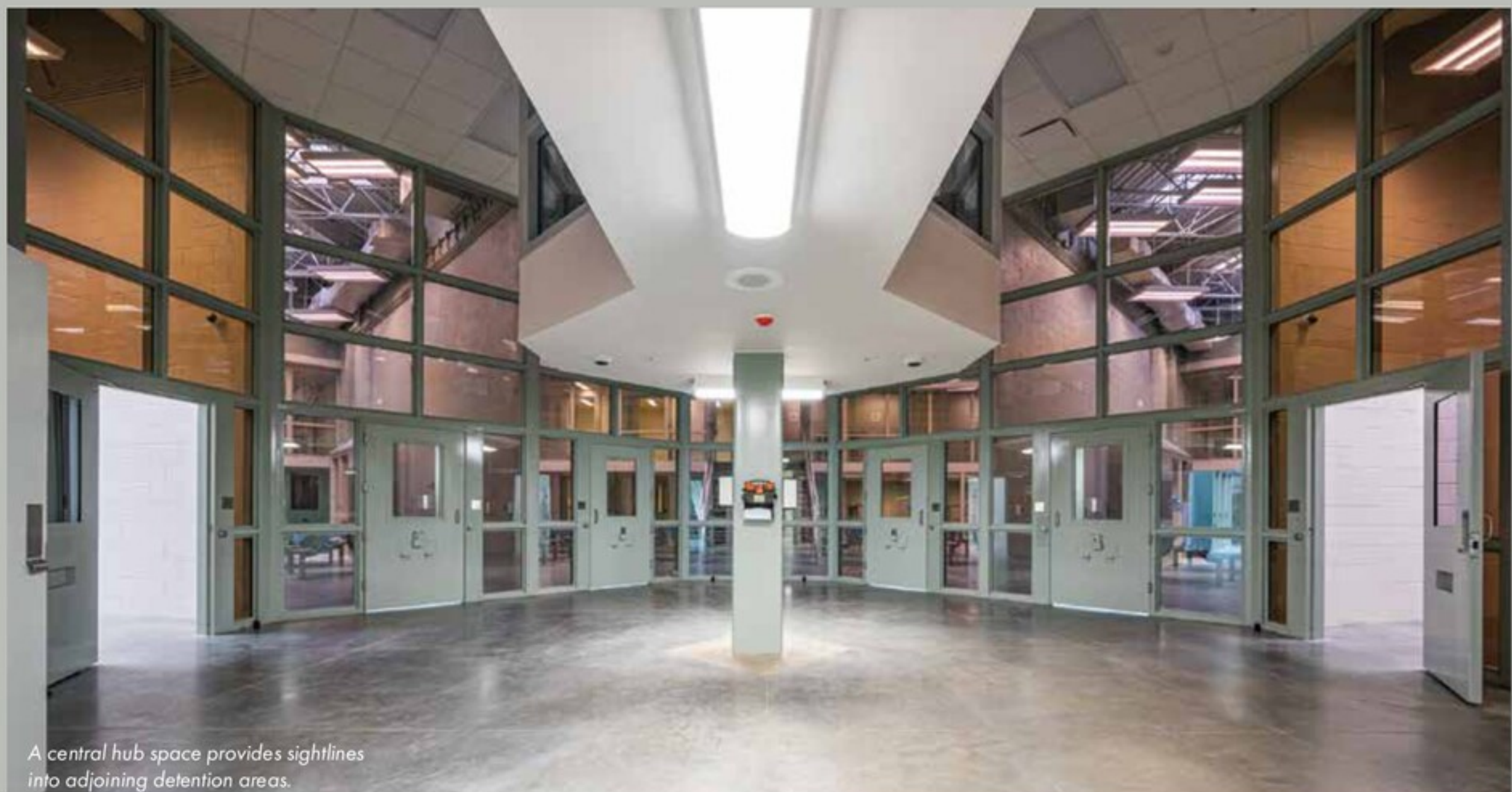
A central hub space provides sightlines into adjoining detention areas.

Fulton County Unveils Impressive Sheriff's Office & Detention Center