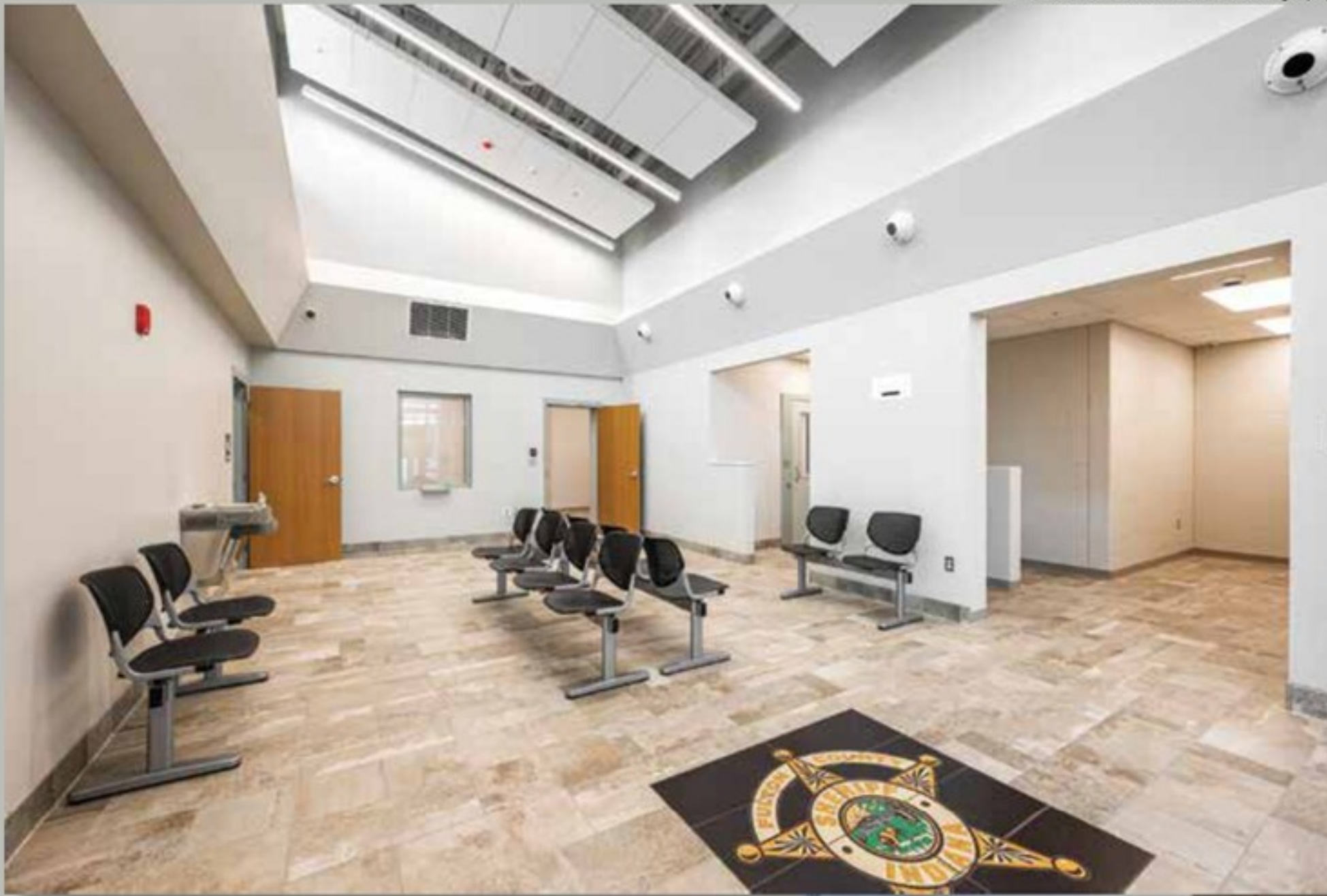
A modern reception area showcases a sleek and angular design.