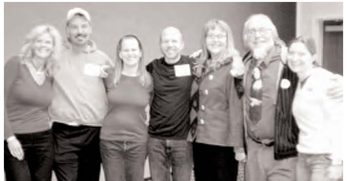
2009 Delegates for National Convention in Orlando.