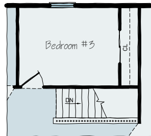
RAILING ON SITE BY OTHERS OPTIONAL BASEMENT STAIRWAY LOCATION