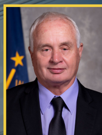
State Senator Rick Niemeyer Senate District 6