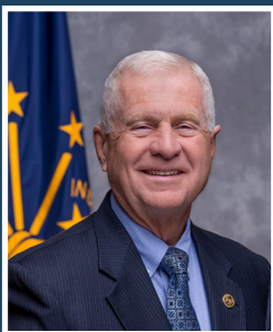
State Senator Ed Charbonneau Senate District 5