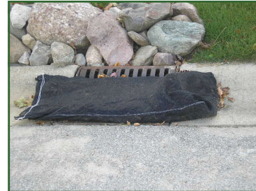
Mesh bag, filled with # 2 stone and large mulch