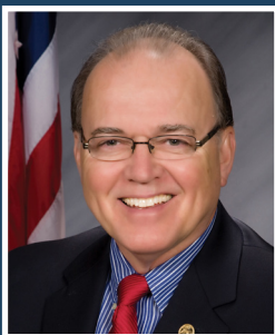
State Senator Jim Buck Senate District 21