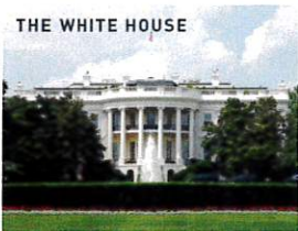
THE WHITE HOUSE