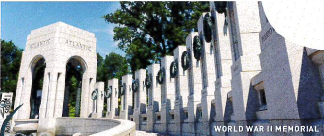
WORLD WAR II MEMORIAL