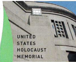
UNITED STATES HOLOCAUST MEMORIAL

Here's all that we're going to do and see!