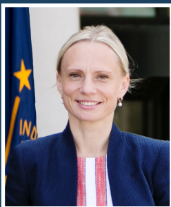
State Senator Victoria Spartz Senate District 20