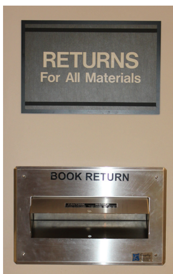
inside return slot