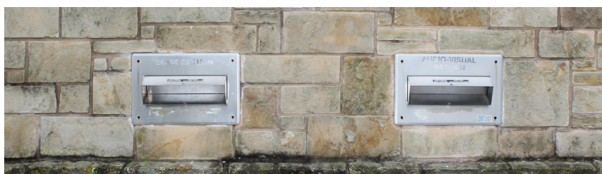
outside return slot

This is where I return my materials at the library. When it is time to return my materials, I will put them carefully in the return slot at the Welcome Desk. There are return slots outside, too. They are near the front doors and I can return my items here on days when I'm not going inside.