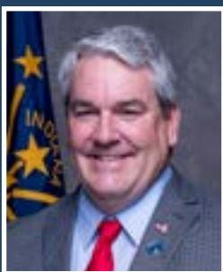
State Senator Andy Zay Senate District 17