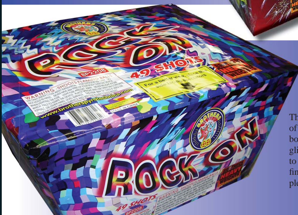
Rock On 49 shots Item # 1771 Pack 4/1

These shots totally rock! A big fan of gold brocade to red glittering bouquets, gold brocade to green glittering bouquets, gold brocade to blue bouquets and a seven shot finale of chrysanthemums with purple stars!