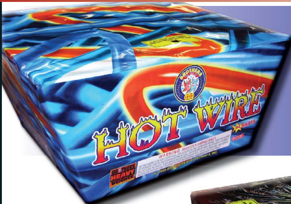
Hot Wire 44 shots Item # 1770 Pack 4/1

White & yellow glittering willows and willow mines to red stars and green glitter. Crackling stars and crackling star mines to pink glitter and a five shot finale of red, green and blue palms with crackling!