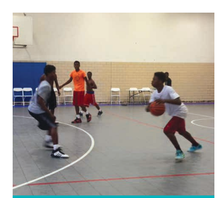
Teens enjoy a game of basketball at the Boys & Girls Club of Muncie where the mission is to inspire and enable young people to reach their full potential.

Nearby, Motivate Our Minds is also experiencing transition. Providing afterschool enrichment programming to elementary and middle school students, Motivate Our Minds has been a staple in the Whitely Neighborhood and the Muncie community. For several years, the organization has looked for ways to expand their offerings. Recently they added an academic director to manage the educational operations of the organization. It was only a few months later,