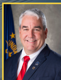
State Senator Andy Zay Senate District 17