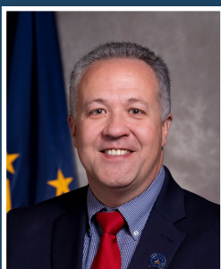
State Senator Mike Gaskill Senate District 26