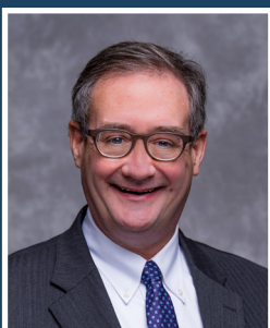
State Senator John Ruckelshaus Senate District 26