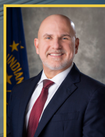
State Senator Scott Baldwin Senate District 20